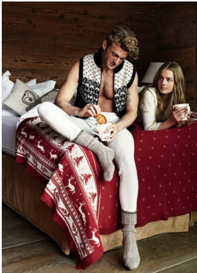
ABOVE SHE WEARS Jumper, H&M, £29.99; tights, Next, £10; socks, Burlington, £18 | HE WEARS Jumper, Topman, £36; Trousers, Uniqlo, £14.90; Socks, Falke, £16

For those who want to party in a luxury chalet, this is the place. Sir Richard Branson's The Lodge is an opulent little spot for up to 18 guests. For a mere £49,500 (€57,600) a week minimum, you get indoor and outdoor hot tubs, mini ice-rink, unlimited Champagne, egg-shaped baths with designer rubber ducks (an absolute must for the jet-set) and, naturellement , spectacular views. CKVerbier ( ckverbier.com ) has six properties, including the stunning Genticanes, which costs from 28,000 CHF (€22,800) a week for up to 12 people, and includes a chef, two hostesses and a dedicated chalet manager who'll book husky rides, ice go-carting or anything else you fancy. Needless to say, few of us will be taking rooms at either place. However, there are plenty of far less pricey options dotted around the resort. Hotel-wise, the Nevai is walking distance from the main lift and has