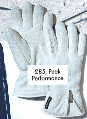
£85, Peak Performance