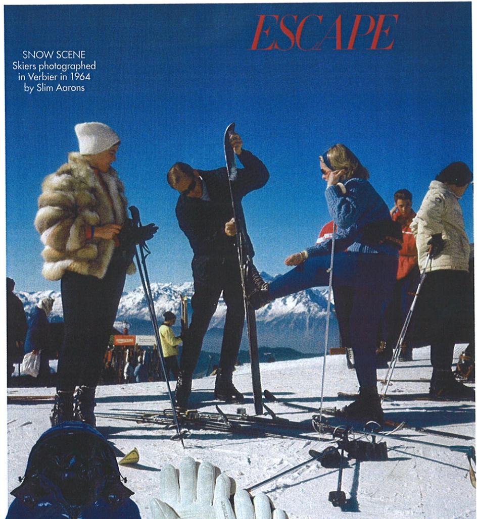
SNOW SCENE Skiers photographed in Verbier in 1964 by Slim Aarons

PHOTOGRAPHS: SLIM AARONS/GETTY IMAGES, GRAHAM WALSER. SEE STOCKISTS FOR DETAILS