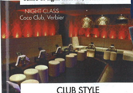
NIGHT CLASS Coco Club, Verbier

Be sure to try the absolutely classic raclette at Le Caveau (+41 27 771 2226), as well as dawn pain au chocolat at the midnight bakery behind Place Centrale.